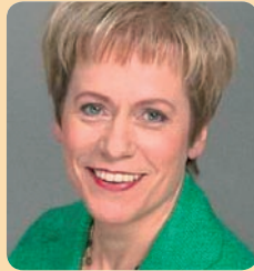
Ingibjörg Sólrún Gísladóttir Party Leader and Member of Parliament, Social Democratic Alliance