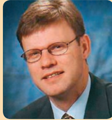
Arni Mathiesen Minister of Finance